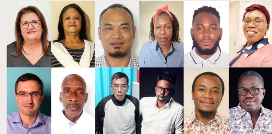
Current members of the LAT-CAB